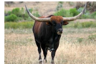
MISS RODEO AMERICA