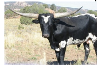
HUNTS HOT SHOT DEIGO