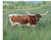
Hunts Demands Respect